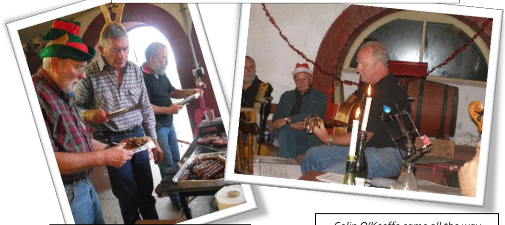
The Christmas feast was enjoyed by all