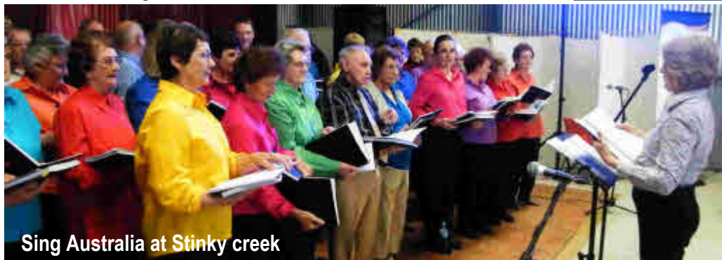
Sing Australia at Stinky creek