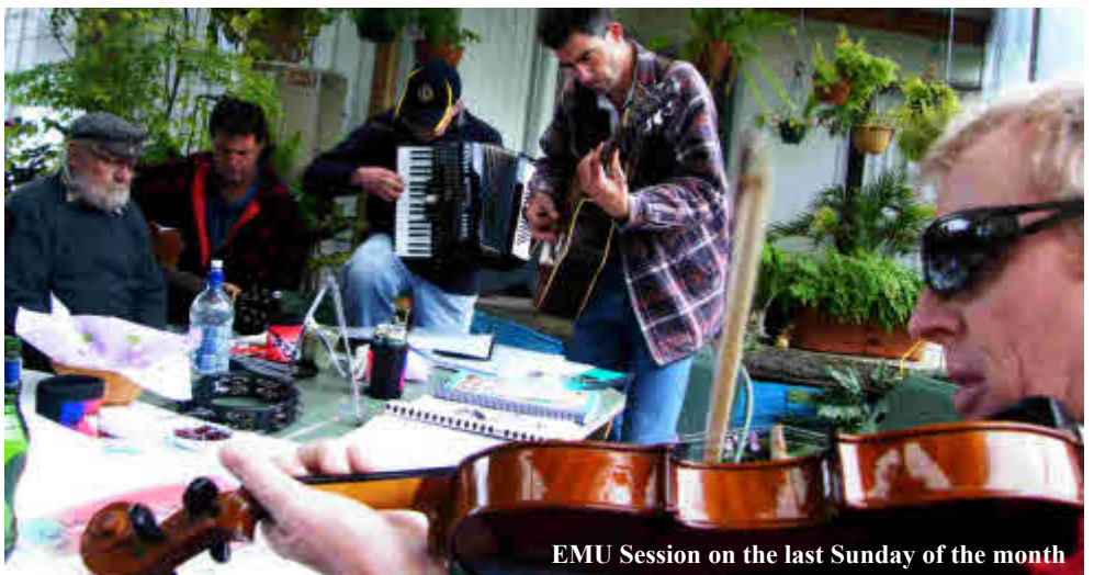
EMU Session on the last Sunday of the month